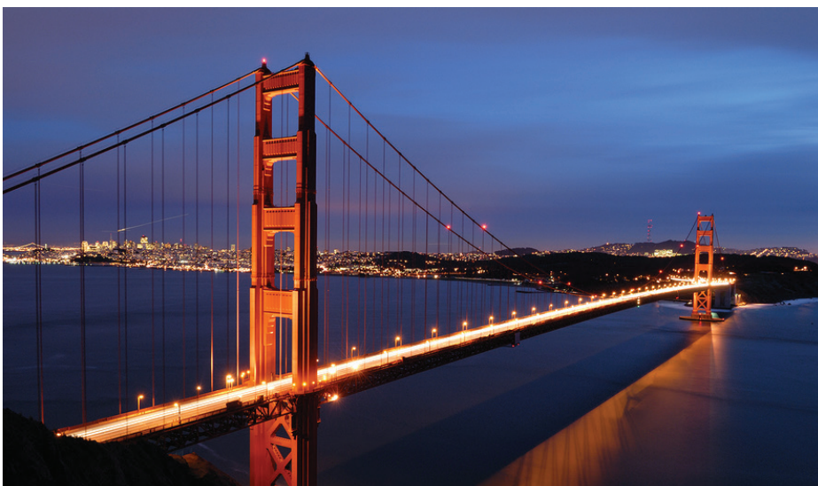
The first meeting for WiOPS Northern California Chapter will be held January 17 in San Francisco.